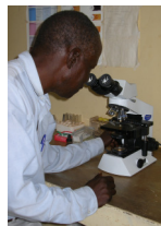
Checking a blood slide in the Clinic Lab

All these conditions are treated at the 2 Clinics that W.O.R.K. supports by well trained and dedicated staff. The drugs are available and all patients are treated first and the costs discussed afterwards! No one is refused necessary treatment. Our Widows and Orphans are cared for as a priority to ensure their good health