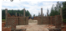
New Dormitory underway!

The Hostel for our Students in the school holidays has become increasingly important and will initially offer 12 beds with the possibility of adding another 12 as need arises.