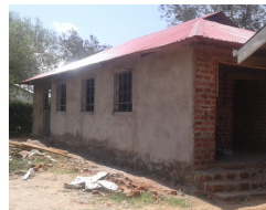
Male Ward nearing completion

Namboboto Clinic is in an isolated & poor area. It is busy and struggles with limited equipment and space. The Male ward will ensure that the men are also well looked after.