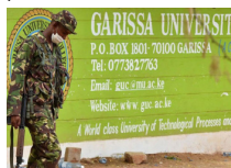
This attack with others in Kenya