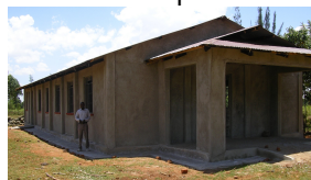
The Principal outside the Dormitory

The dormitory for girls at Sinoko Youth Polytechnic is almost completed.