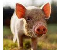
A pig newly bought from the market!

Our Widows continue to amaze us. Many of these elderly ladies have never been to school and cannot read or write BUT they are full of life and initiative. In Namboboto the Widows have started their pig project buying and selling and slowly it is beginning to support the widows and their families.