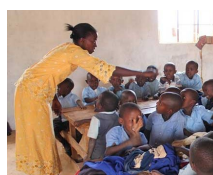
ECD Class in progress!