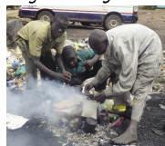
Street kids in Kenya