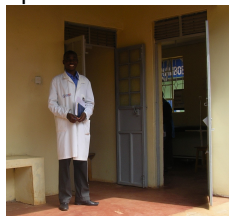
Clinical officer in front of the door to new male ward and nurses' night station

The Male ward and Minor Theatre at Namboboto Health Centre are completed.